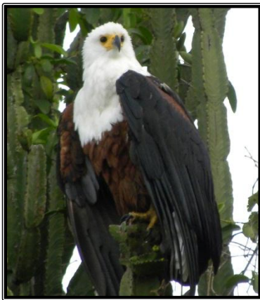
African fish eagle

Abdim's stork African darter African fish eagle African hoopoe African jacana African skimmer African spoonbill bateleur eagle black-collared barbet black crane black egret black flycatcher black-eyed bulbul blacksmith plover brown snake eagle Burchell's starling carmine bee-eater cattle egret chirping cisticola collared sunbird common moorhen common sandpiper