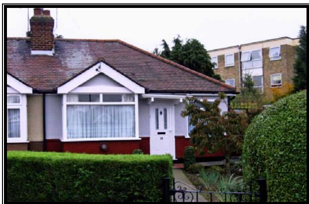
I was born in this bungalow in Romford, Essex.

Even as a youngster I was very observant. My mother would often say I “didn't miss much”—something that would stand me in good stead throughout my life. Blessed with a fertile imagination (which sometimes got the better of me), I discovered early that I loved to write—and, to my surprise, was fairly good at it. This attribute was to come in handy in the years ahead, when my work required a lot of writing. I've always made copious notes about almost everything, and have written piles of letters to friends and family. It just goes to show how an early childhood interest can profoundly affect one's entire life. →