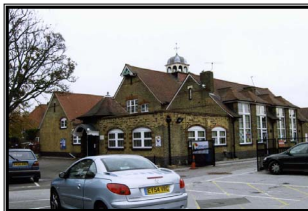
My first school, London Road Primary.